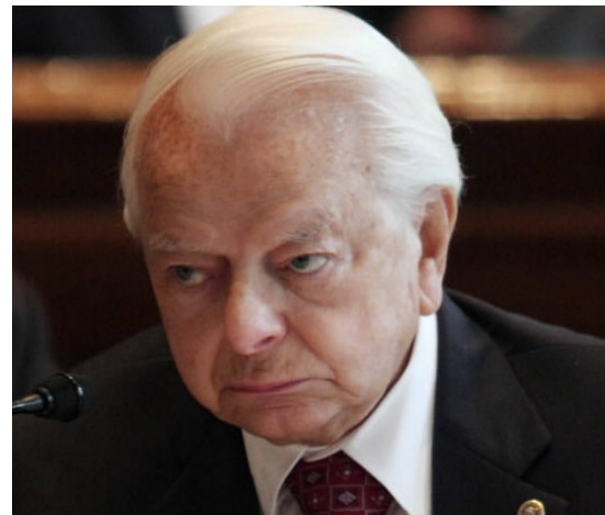
Figure 2. The “Byrd Rule” contained in section 313 of the Budget Act, places limits on what may be contained in reconciliation legislation in the Senate or a conference report. It is named after its author, long-time Senate appropriations chairman Robert Byrd of West Virginia.

» which does not produce a change in outlays or revenues;