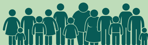
Tribal Communities & Reservations

The Federally-Recognized Tribes Extension Program (FRTEP) Agents help address food insecurity by providing extension to the Tribal communities they serve.